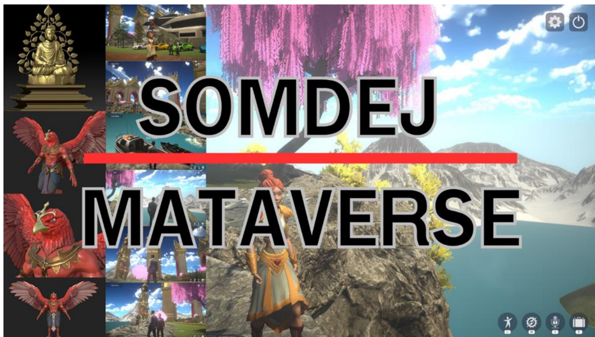
Figure 2: Example of Somdel Mataverse

Remark: The official coin will only have the contract numbers listed on the mentioned site; anything other is considered a forgery (Somdejcoin, 2566). Official website can be found at www.somdejcoin.org .